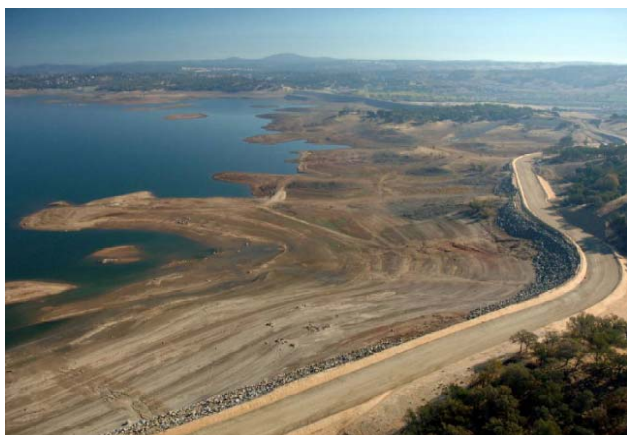
Figure 4 : Folsom Lake, on the American River, near Sacramento, is currently at 23% of average storage capacity. The Sacramento and San Joaquin Rivers 2-year streamflow is in the lowest 10% of the historical range.