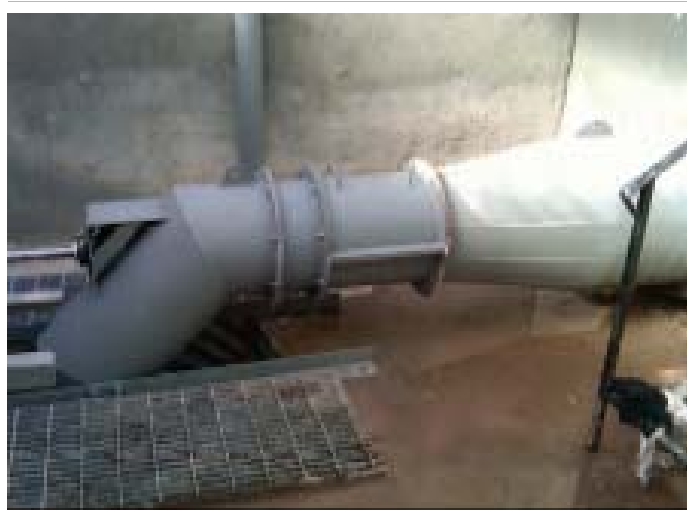
Figure 2: Assembled turbine fabricated by EBID.

Approximately twelve manufacturers were contacted regarding EBID specifications for power production (low head and high flow turbines). Those that could meet the requested specifications responded with costs that far exceeded the grant budget of $265,000. The creative talents of EBID's own engineer, consultants, welder and construction crews were engaged to custom-fabricate turbines and a modular turbine dry well structure. The EBID-fabricated units are considerably more economical to build than directly purchasing turbines from manufacturers. Figure 2 shows one of EBID's fabricated 36-inch diameter turbines, which is anticipated to produce 10 kW of renewable energy.