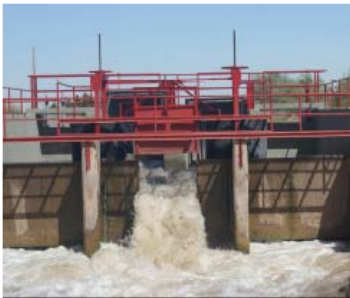
Figure 1: Hydropower pilot project location.

EBID has already begun the process of locating other potential hydropower sites.