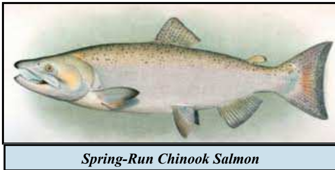
Spring-Run Chinook Salmon

Federal Agency to Determine if Spring-Run Chinook Salmon Should be Listed