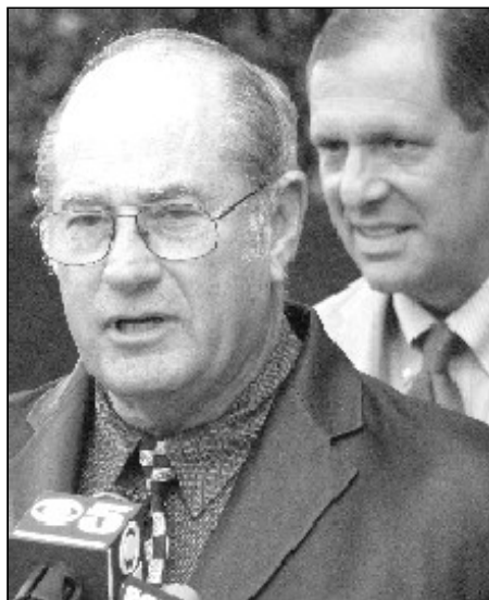
Friant Water Users Authority

At the same time, the settlement limits water supply and cost impacts to Friant Division long-term water contractors. Friant leaders said the